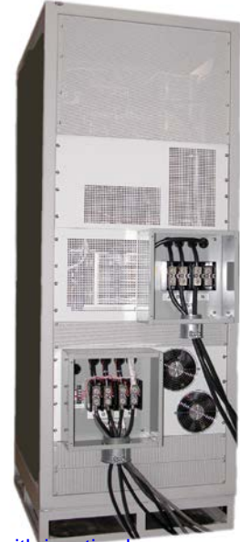
Shown with junction box cover removed